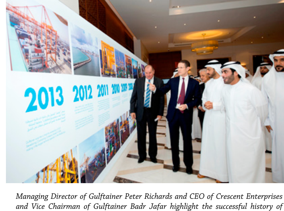
Gulftainer, unveiling its new vision and identity at the Sharjah Chamber of Commerce & Industry. GAMA AVIATION IS FLYING HIGH